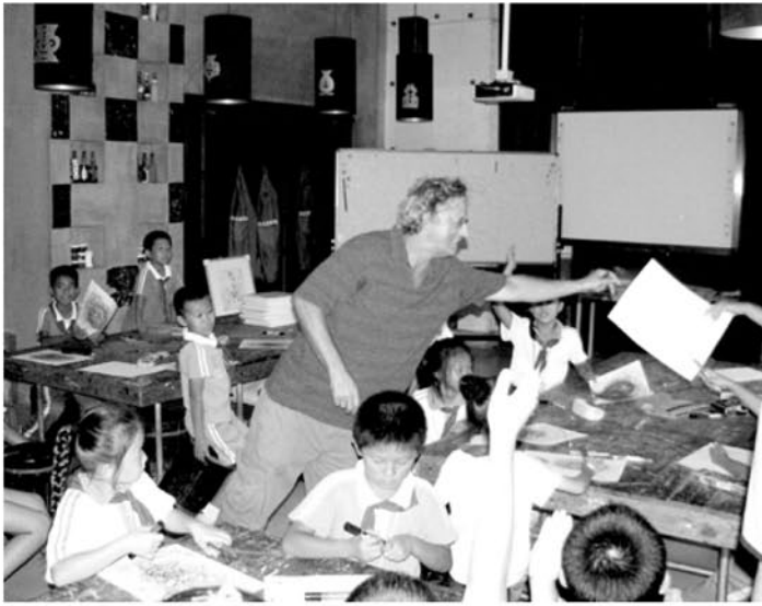
Chameleon educational workshop Shenzhen Elementary School