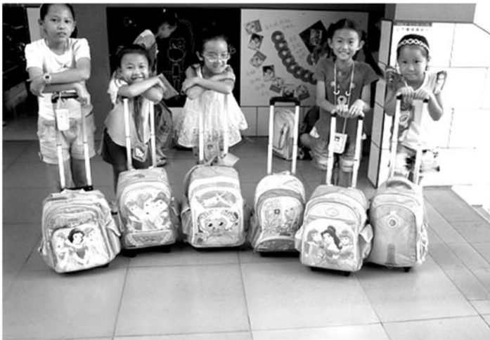
Elementary school students with Barbie backpacks