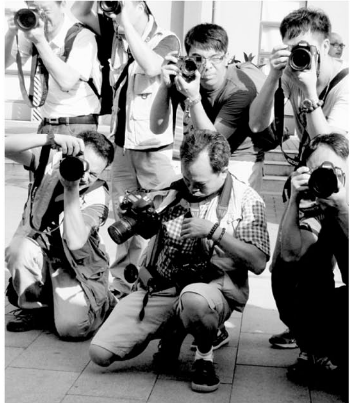
Photo for the community arts project Object/Subject: photographs of the other